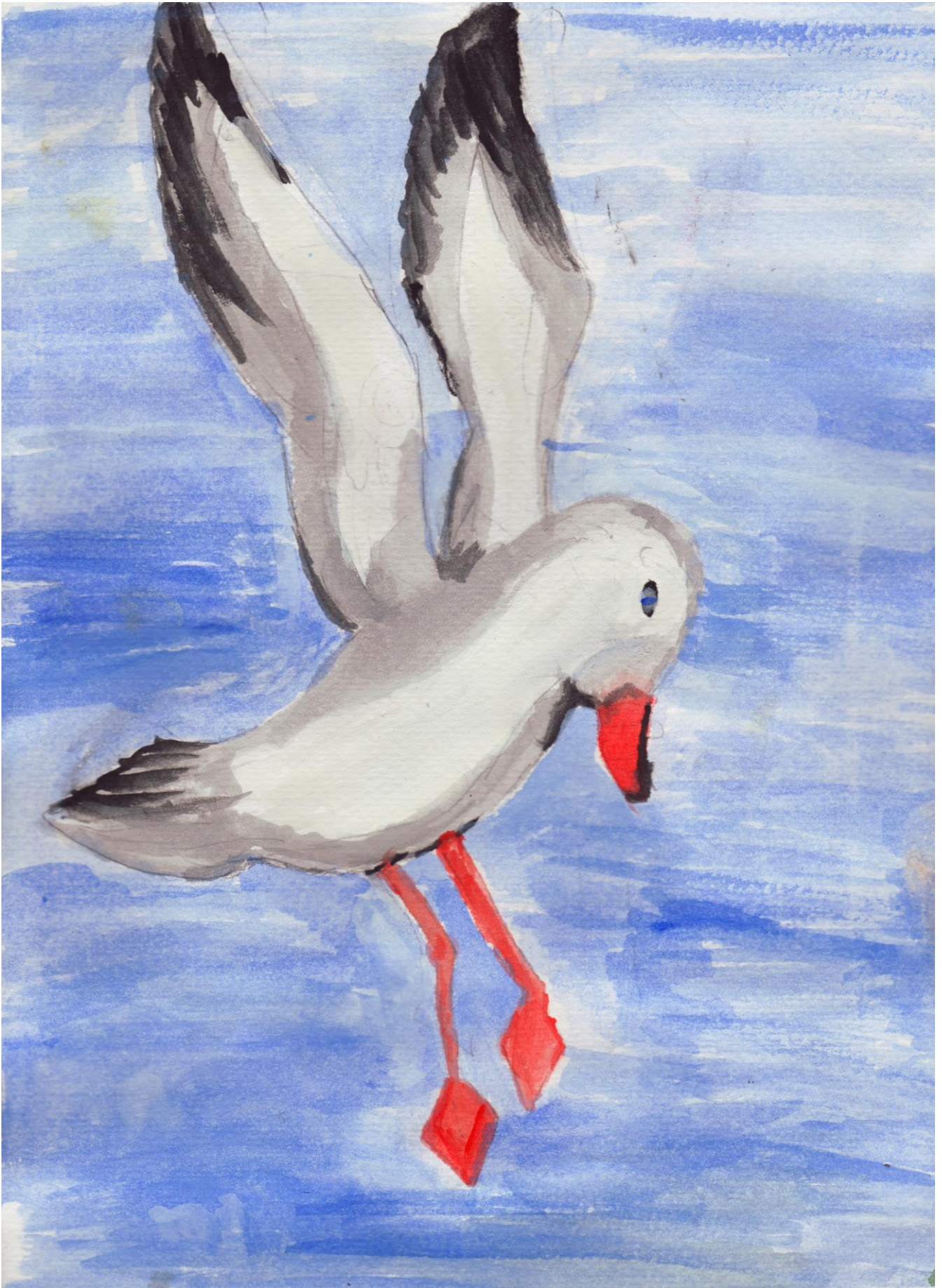
This picture is a copy of a watercolour painting by one of our pupils, age 9