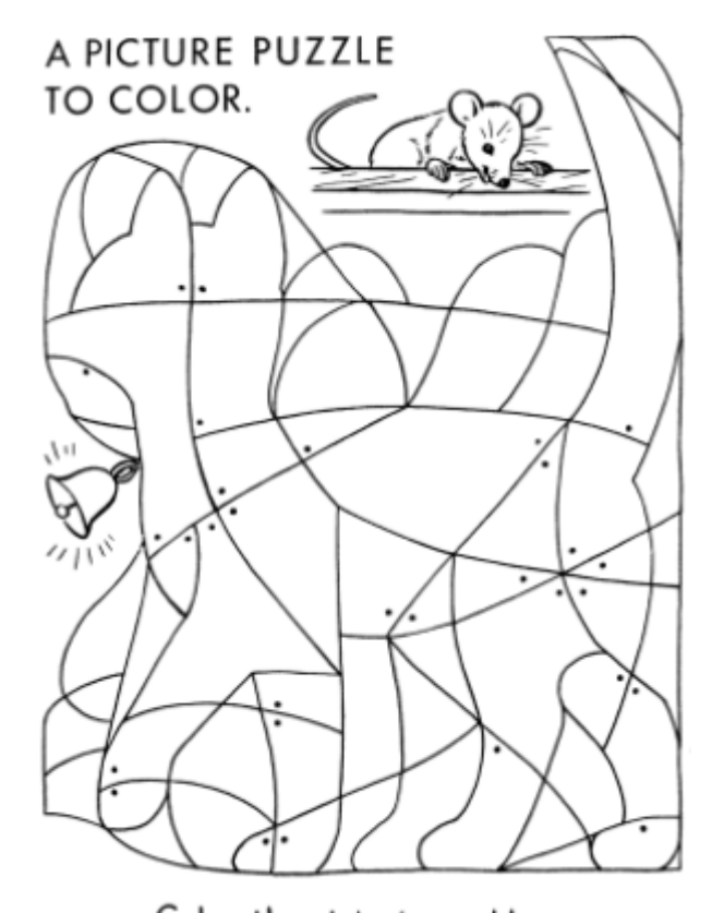
Color the dot pieces blue.